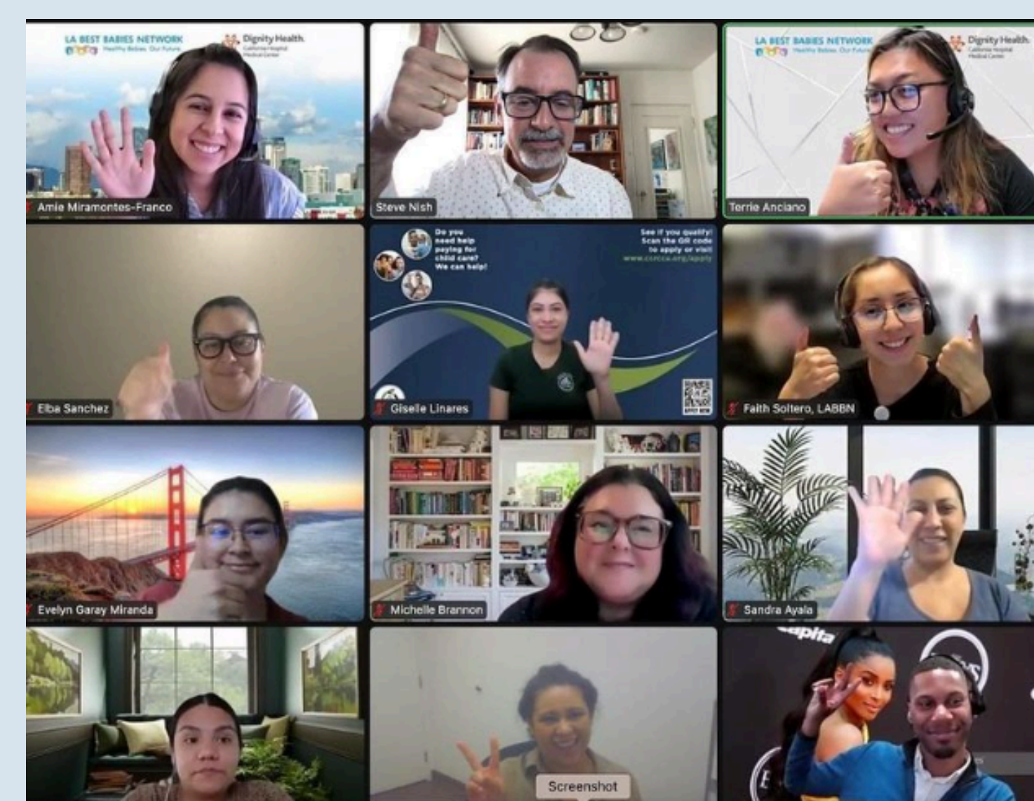
Virtual Training Platform - ZOOM